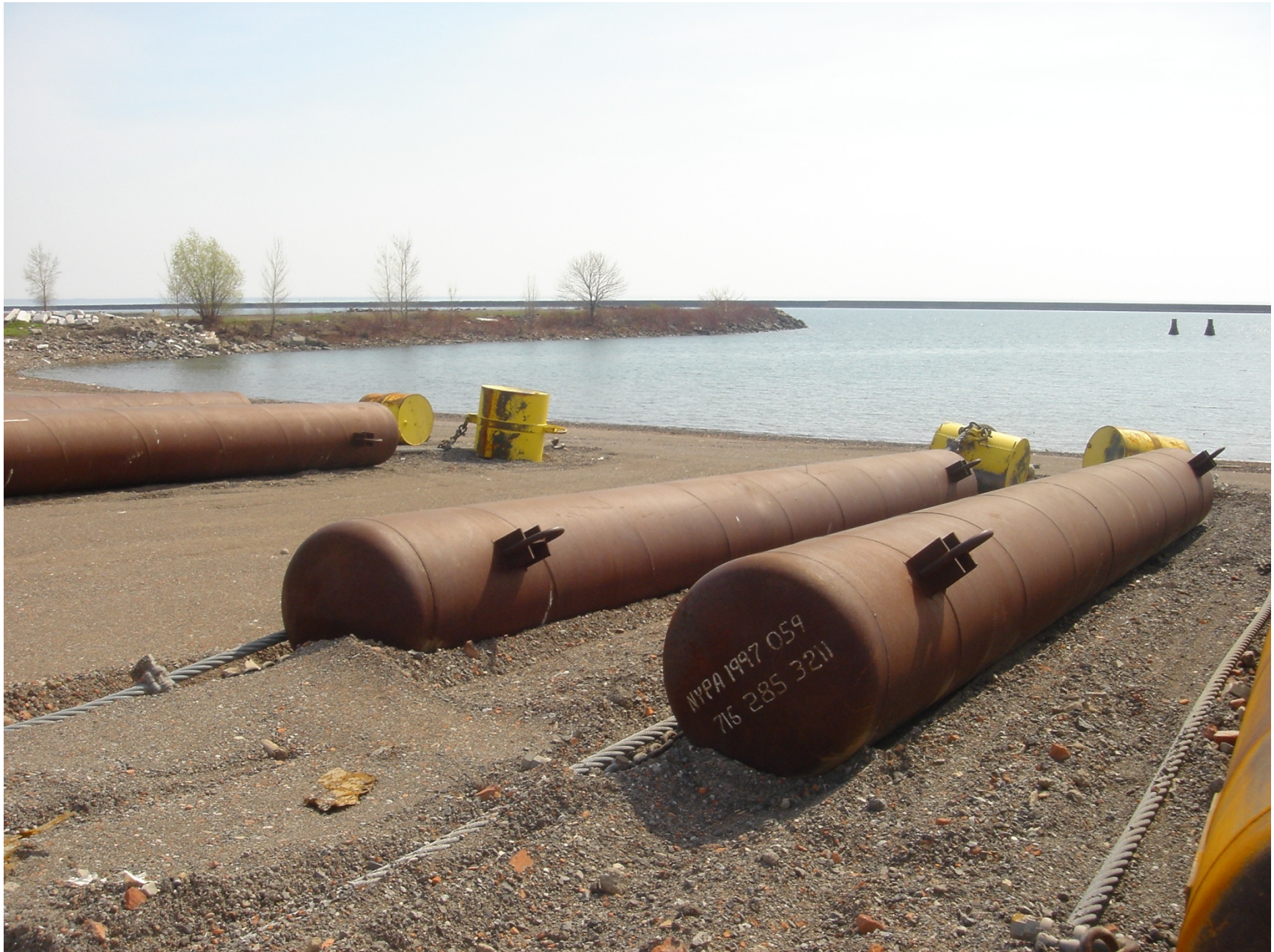
Ice Boom Storage Site on Buffalo's Outer Harbor (2005)